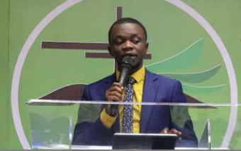
The Apostle's Sermons Recaped