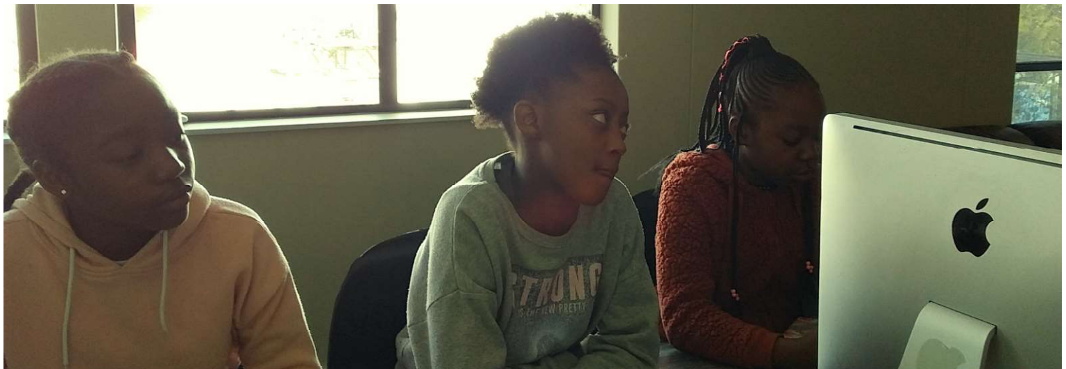
KWW Teens fully engaged and paying attention.

who are playing instruments are making great strides, as they are learning how to play different songs. Our class for the small children has also been hard at work. Their teacher has managed to keep them engaged and working hard. We are expecting to see great things from them.